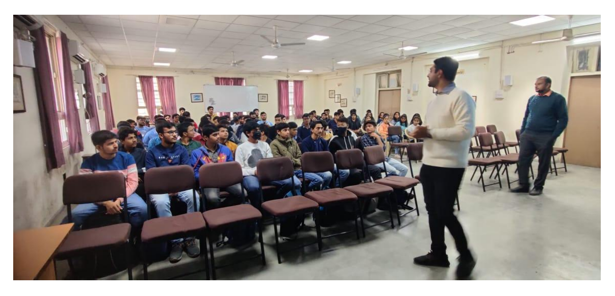
Figure 2 Live Session